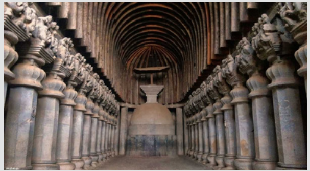
📍 KARLA BUDDHIST CAVES, KARLA