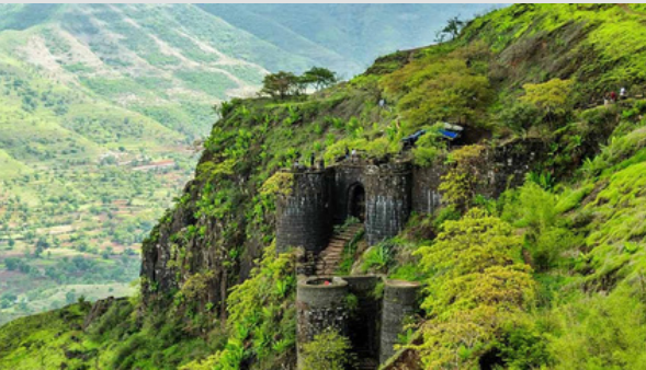
📍 SINHAGAD FORT, THOPTEWADI