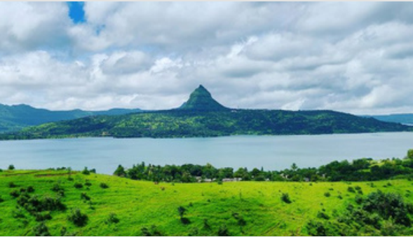
📍 PAWANA LAKE AND DAM, KAMSHET